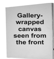
Smooth edge may be painted