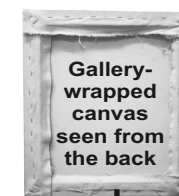
Canvas stapled on the back of the canvas. Hanging wire is attached to the back.