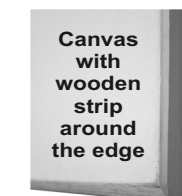
Corner detail: Wooden strip around smooth edge. The wooden strip may be painted.